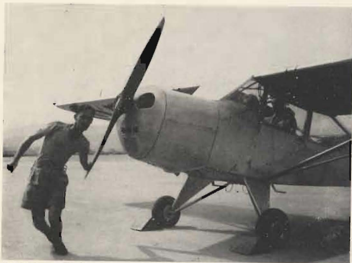
Switch on, contact, and away she goes. Prop-swinging on an Auster is the mechanic's job. Austers are of great use to the British Commonwealth Occupation Force in Japan and are used for quick movements between units of a widely-scattered force.