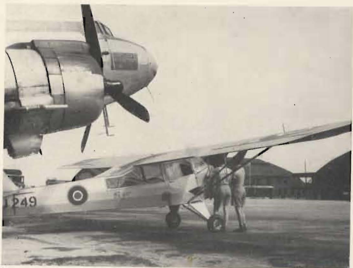
By present-day standards the Dakota is not a huge plane, but it certainly dwarfs this British Commonwealth Air Group Auster standing beside it on the Iwakuni Airfield in Japan.