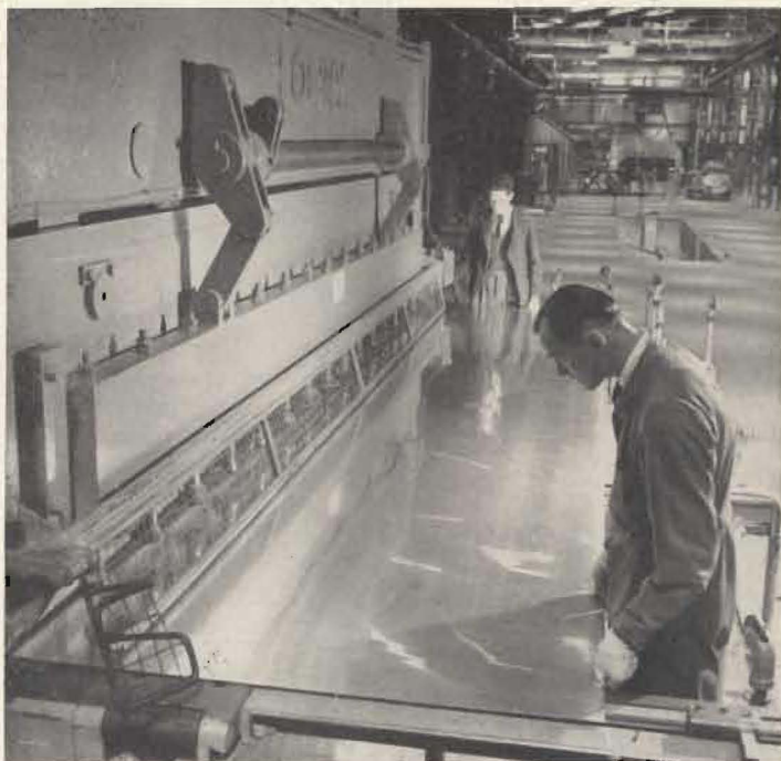
Cutting 18-ft. wide sheets at the Falkirk Rolling Mills.

AIRCRAFT MATERIALS.—The first world war gave the initial impetus to the aluminium industry, and between the wars the market for the metal increased progressively. In the interval between the wars aircraft designers were for many years uncertain whether alloy steels or light alloys would eventually prove to be the best materials upon which to base designs. It was not until about 1930 that light alloys gained the ascendancy in Britain and America, though France and Germany had been using these materials almost exclusively for several years.