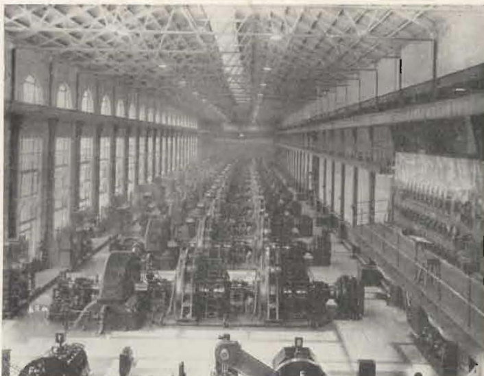
Interior view of the Hydro-electric power-house at the Lochaber Aluminium Reduction Works.